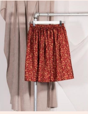
School Holiday Workshops & Term 4 Classes - Ages 8+ See website for all sewing classes: www.threadroom.co.nz