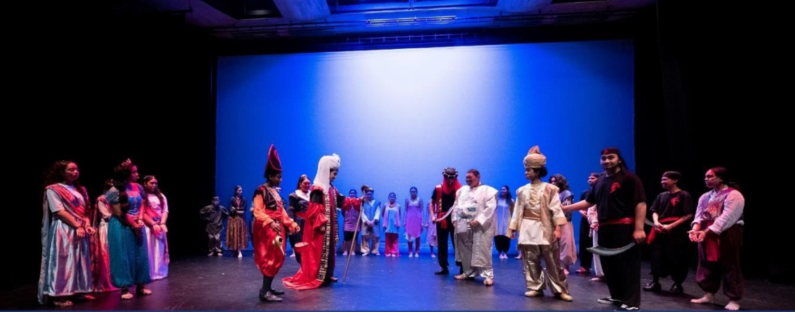
Transform lives through faith, knowledge and education founded on Marist traditions.

Year 7 - 13 Catholic co-educational college with no zoning restrictions.